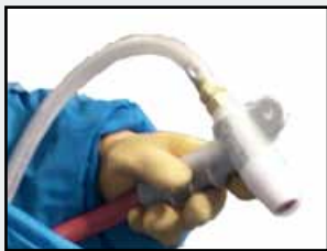
Extra gun for manual cleaning.