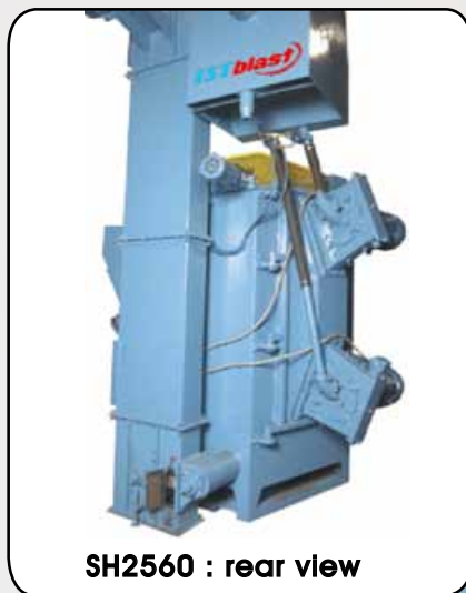
SH2560 : rear view