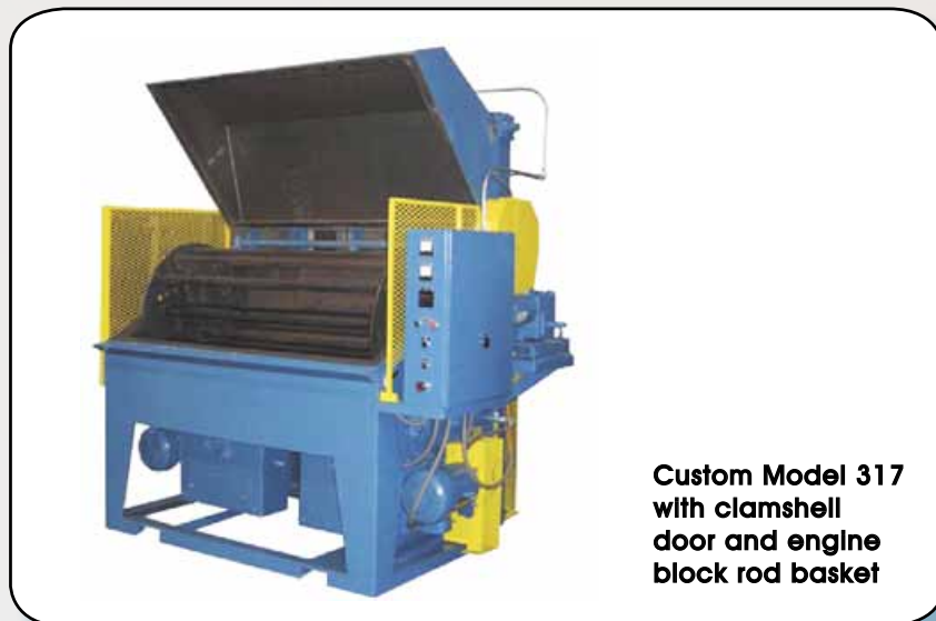
Custom Model 317 with clamshell door and engine block rod basket

With an accomplished and proven design staff, ISTblast can build equipment from the ground up or simply modify existing models to tailor fit your cleaning application.