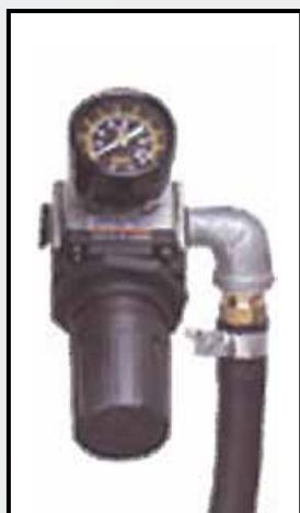
Air regulator gauge