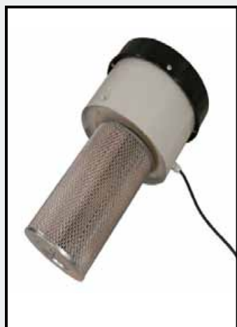
Dust collector filter