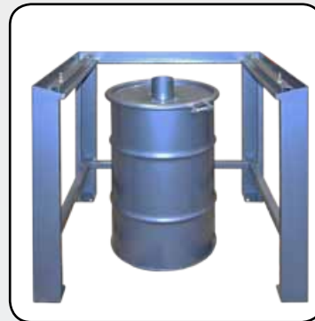
Extension feet and 30 gal barrel