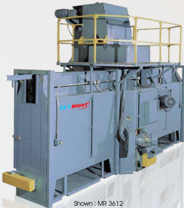
Shown : MR 3612

Larger machines with larger Lip Type Airwash Separator and up are available with more wheels (like model MR5412 shown as following)